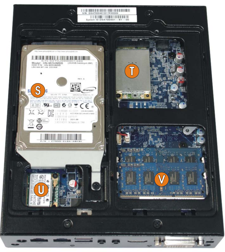
*) The WLAN module is included in the scope of delivery in the form of a Mini-PCle card. The other components such as hard disk, SSD, memory modules, other Mini-PCle cards or mSATA modules are not.