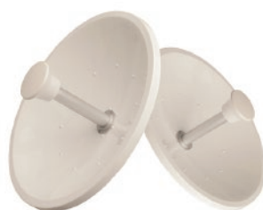
32dBi Dish Antenna WIS-AND5832