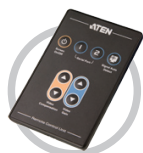
IR Remote Control Included